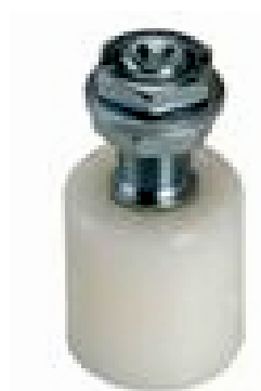
Zinc Plated Bolt